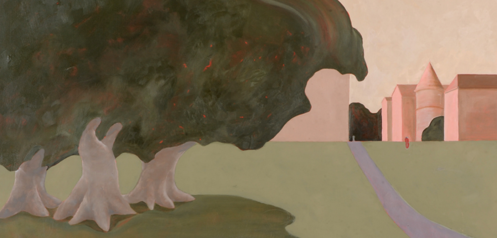
Image: St Margaret's Romantic Times Past , 2022, oil on canvas, 102 x 112 cm